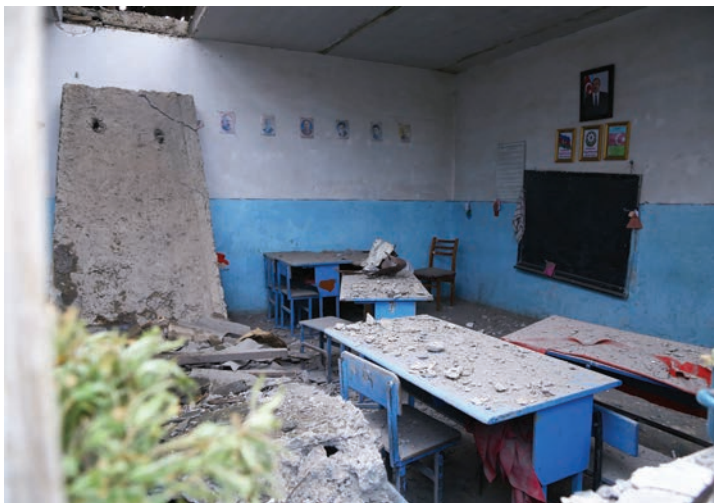
Aghdam, Sarijali secondary school attended by 220 pupils destroyed by artillery shelling