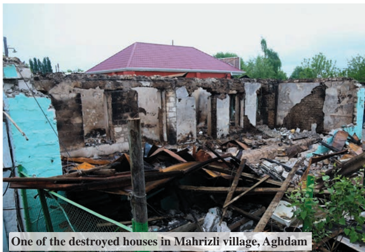
One of the destroyed houses in Mahrizli village, Aghdam