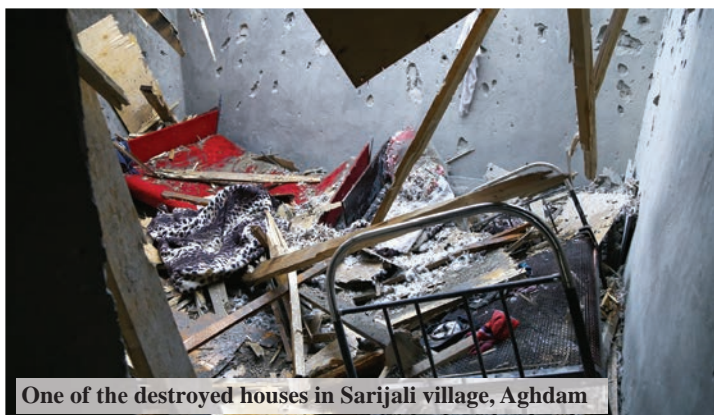
One of the destroyed houses in Sarijali village, Aghdam