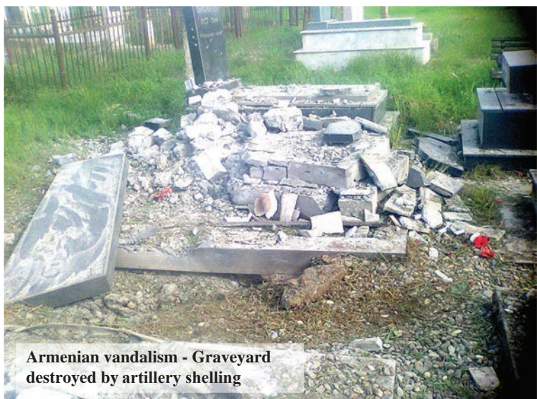
Armenian vandalism - Graveyard destroyed by artillery shelling